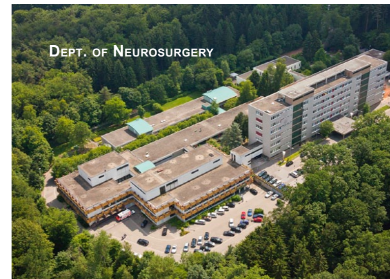
DEPT. OF NEUROSURGERY